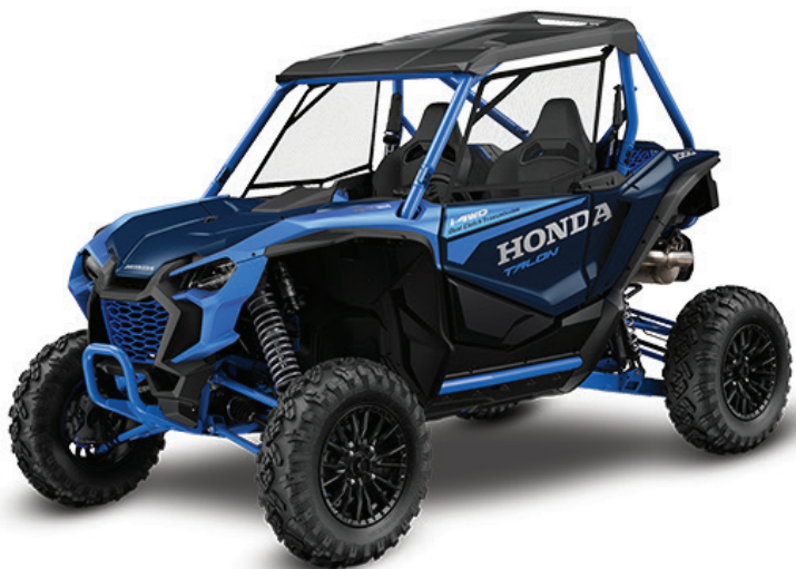
Talon 1000R Fox Live Valve