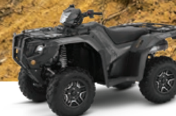
FourTrax Foreman Rubicon 4x4 EPS